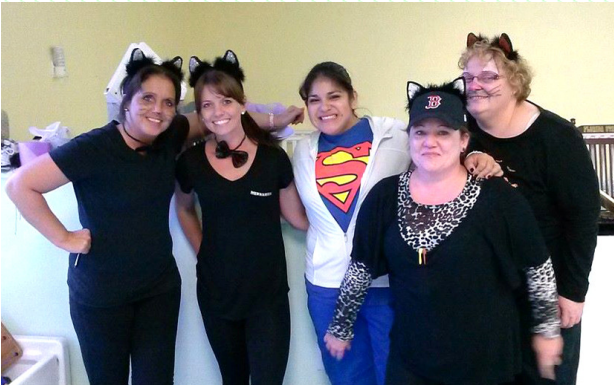
Waddler Room Kittens (nurses)