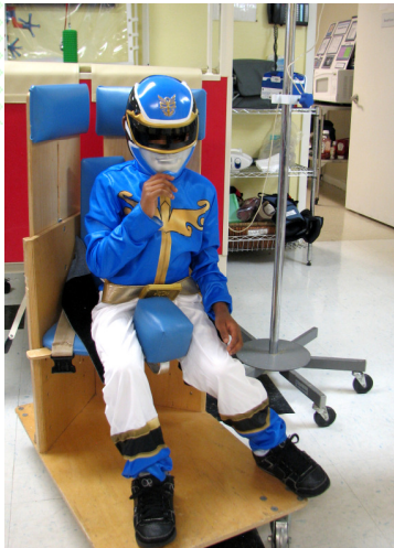
Therapists are creative!